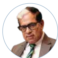
Justice A. K. Sikri Former Judge Supreme Court of India