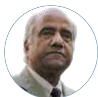
Justice B N Srikrishna Former Judge Supreme Court of India