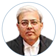
Hon. Justice Manmohan Judge, Delhi High Court